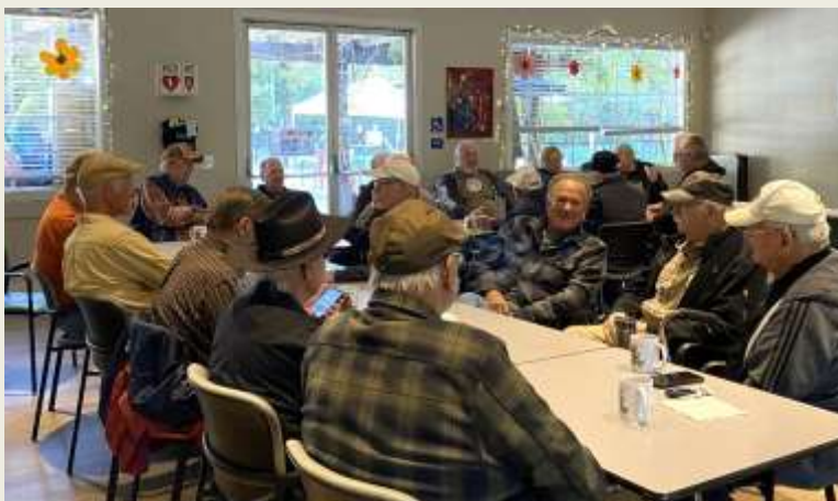
Coffee at the senior center 10-29