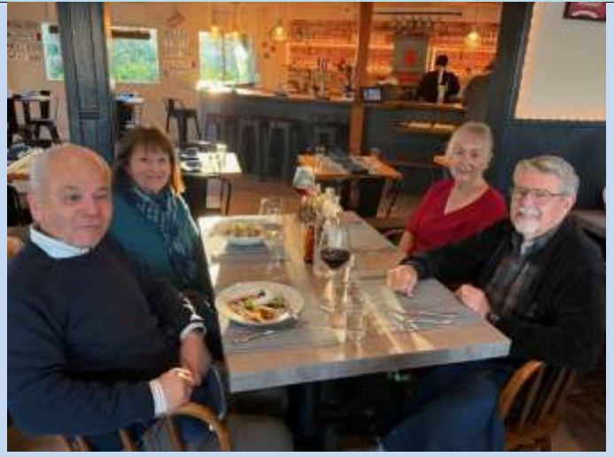
Table 4, the foodies.