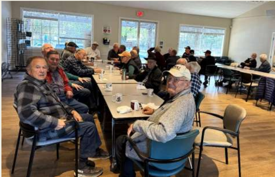
Coffee at the senior center 1-7-2025