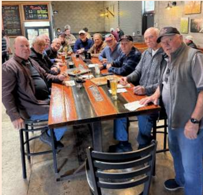
1/17 at Barley & Bine

If you are free, come and enjoy a cold beverage and lively conversation and so-so jokes. The schedule for February is: 2/7 Charley's; 2/14: Mt. Mikes; 2/21 El Gallo Negro; 2/27 The Publican.