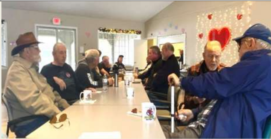
Coffee at the senior center Please invite a friend.