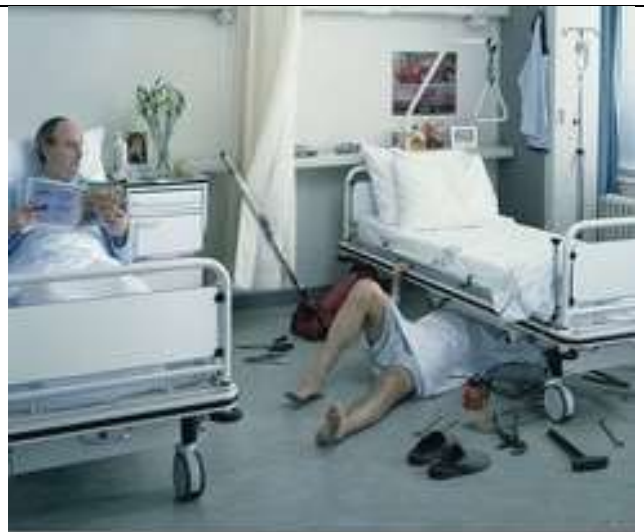
What happens when Old Car Guys get sent to a nursing home ...

The trouble WITH RETIREMENT IS YOU NEVER GET A DAY OFF