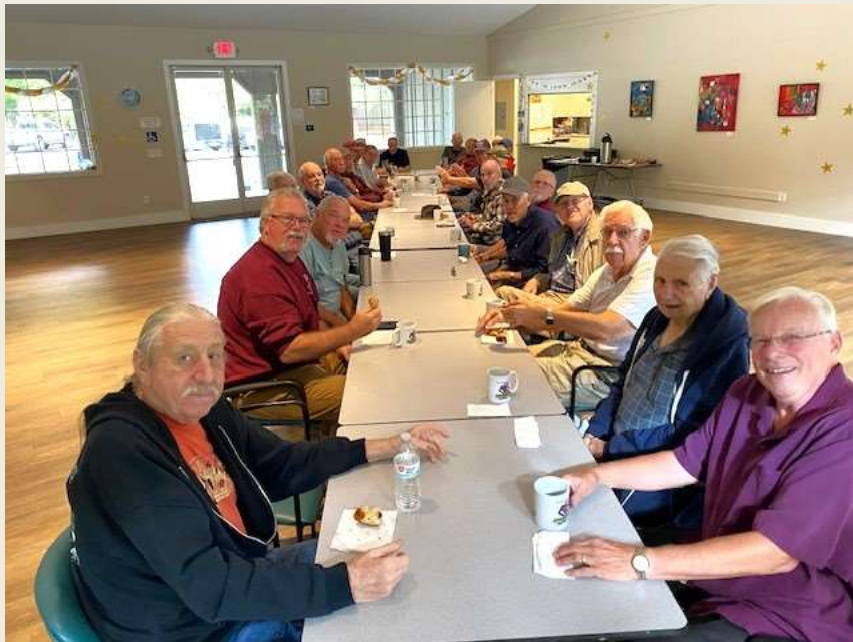
September 11th coffee at the senior center