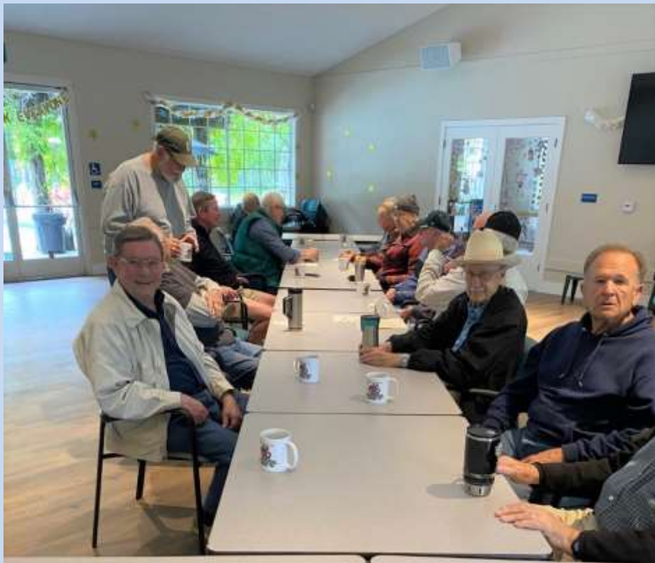
May 30 th coffee at the senior center

Coffee time attendance at the Senior Center is good but please let's bring some guests.