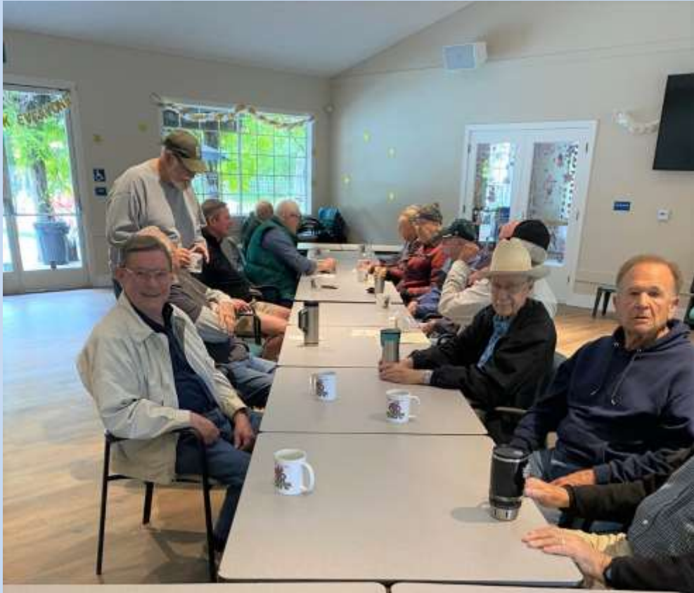
May 30 th coffee at the senior center

Coffee time attendance at the Senior Center is good but please let's bring some guests.