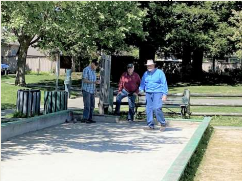
Bocce Ball at Lakewood Meadows Park Thursdays at 10:00am