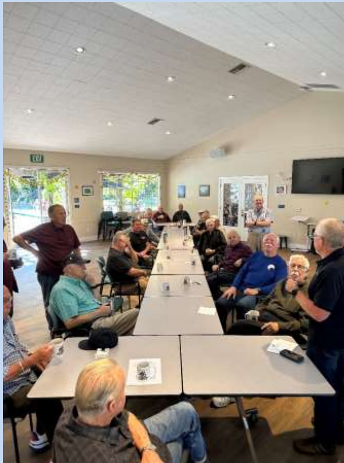
June 20 th coffee at the senior center