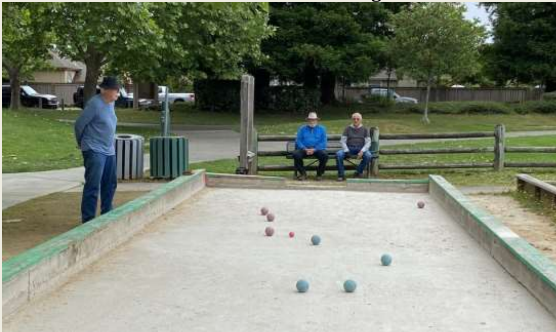
Bocce Ball at Lakewood Meadows Park Thursdays at 10:00am