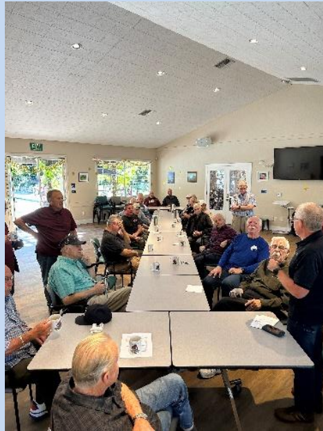
Coffee at the senior center

Recruitment is going well. We brought in three new members at the July meeting. We should have one or two more next month. Coffee is going very well at the Senior Center. About 20 members or more every Tuesday morning.