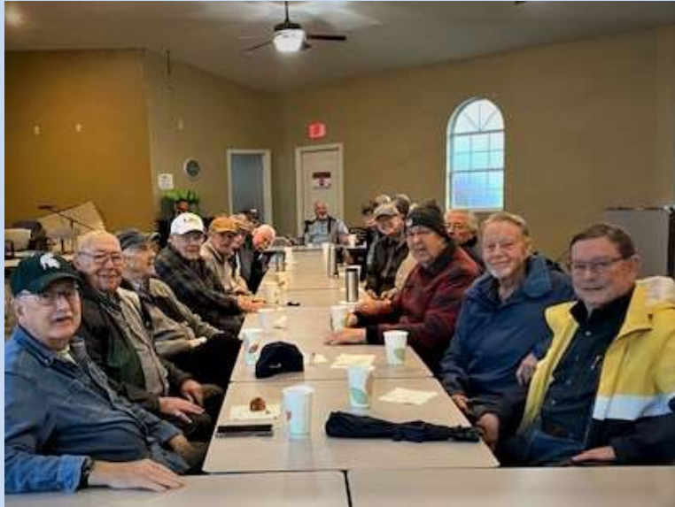
March 21st Coffee Time