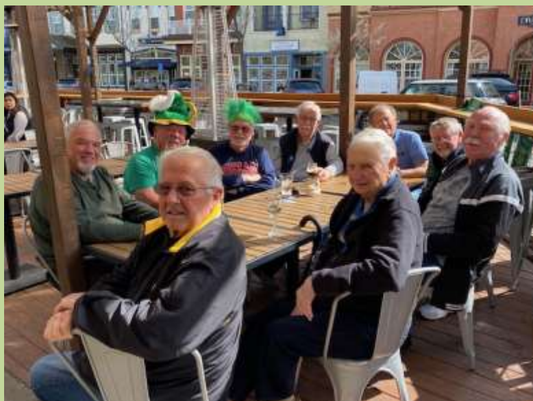
Happy Hour 3/17 at the Flagship